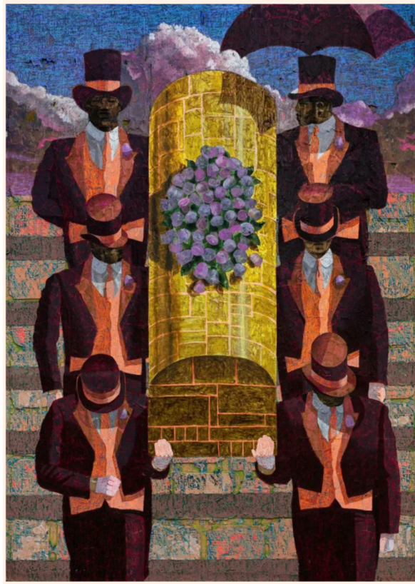
'Pall Bearers' (2020)

Descending a staircase in a compressed, vertiginous space, six black men with pink gloves carry the coffin, tilting it towards us: an accusatory, hard, gleaming cylinder adorned with a soft mauve wreath. Extravagantly dressed in mulberry suits, orange waistcoats, glamorous as singers in a band, dignified, a cohesive sextet, they are also vulnerable, uneasy, broken.