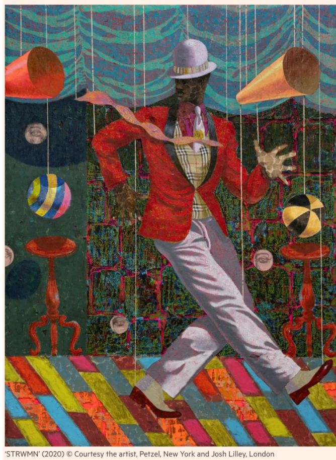
'STRWMN' (2020)

eliminate the radio first. I wanted to evoke a sense of looming uncertainty, danger, discord, isolation.”