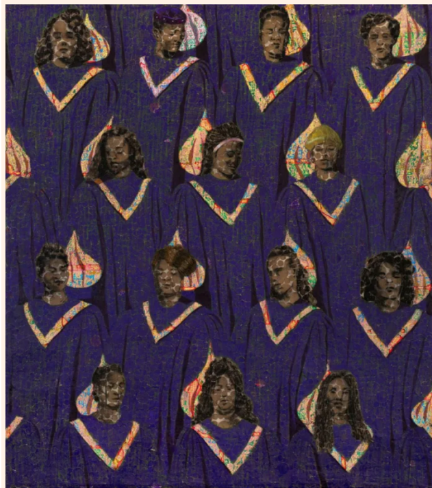
'Chorus of Maternal Grief' (2020) © Courtesy the artist, Petzel, New York and Josh Lilley, London

“I once heard optimism described as a survival instinct,” Fordjour replies when asked if he is optimistic for social change. “I am probably more concerned with survival, especially as an artist. The hope is that your life’s work survives . . . the oeuvre itself is decidedly more dubious and questioning.”