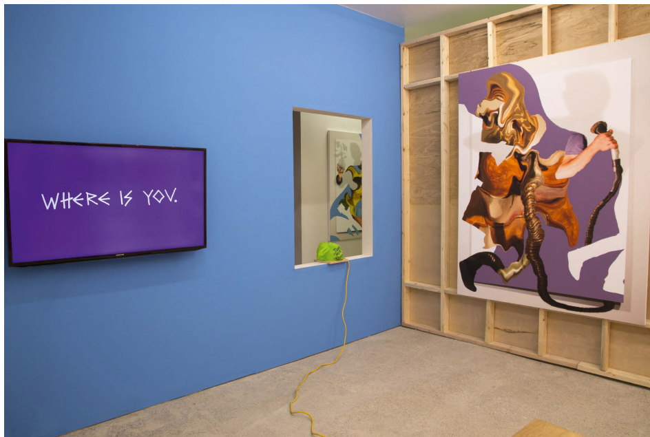
Pieter Schoolwerth, Your Vacuum Sucks , 2014, Installation view What Pipeline, Detroit

PS: The result of this superimposition (which occurs in my both the paintings and the film) is an image of both spatial and temporal compression – two discrete moments in space and time are represented with a single image of a body. The figures the lead character is interacting with are feeding back their own images on themselves, (which is how a platform like Instagram works: you take a selfie, post it, and it comes back with ‘likes’). This visual model has an inverse relationship to that of cubist space: the cubists depicted one body from multiple points of view; I am depicting multiple bodies from one point of view - which is so often the case today when one’s body is firmly planted in front of a screen opened up onto multiple space-less vistas.