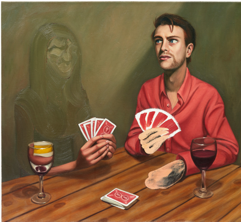
Pieter Schoolwerth, Bluff , 2006, Oil on canvas, 96,5 × 108 cm, Courtesy: The artist, Kraupa- Tuskany Zeidler und Captain Petzel, Berlin, und Petzel Gallery, New York