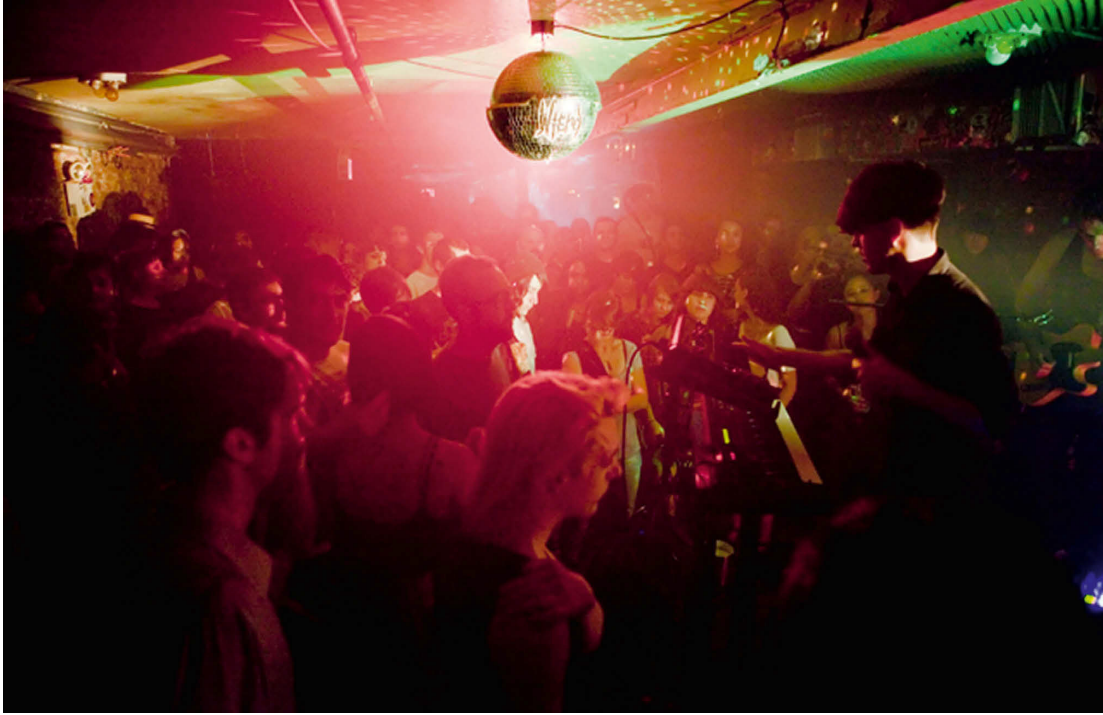
Automelodi performing live at the Wierd Party, NYC, 2009