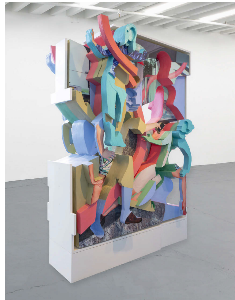
Pieter Schoolwerth Model for Behavioral Surplus Capture, 2019, Oil, acrylic, inkjet and mixed media on foamcore, 261,6 × 180,3 × 96,5 cm, Courtesy: der Künstler, Kraupa-Tuskany Zeidler und Captain Petzel, Berlin, und Petzel Gallery, New York